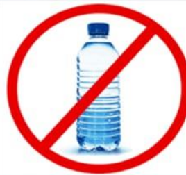
Break up with bottled water