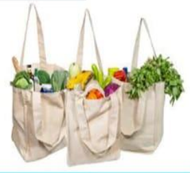
Choose seasonal and local products