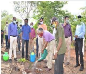
Plant more trees