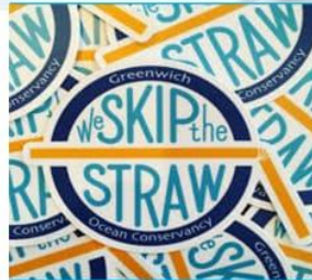
Skip the straw